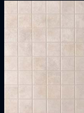
Sandstone 736 4' x 8' x 1/8" panels. 2 1/8" x 2 1/8" tiles.

The sand-textured finish, high-fidelity stone print and smaller tile size of this option makes it an attractive choice for kitchen backsplashes, bathrooms and mudrooms.