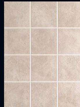
Taupestone 735 4' x 8' x 1/8" panels. 4" x 4" tiles.

The sand-textured finish, high-fidelity stone print and smaller tile size of this option makes it an attractive choice for kitchen backsplashes, bathrooms and mudrooms.